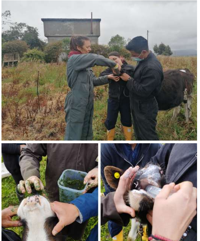
Administration of a neem-based product (in different forms) as part of a field study in Colombia

Lastly, clinical trials may be carried out at local level, but it is important to put their results into perspective, precisely because of these local conditions, and given the multiple sources of variability in the activity of active botanical ingredients – certain practices combine several different active ingredients so that they can complement one another (ANSES 2014). They may sometimes be oriented, on a case-by-case basis, towards tests for substance combinations (looking for synergies or antagonisms between two substances), for improving authentication conditions, for stability, for substance quality and use, or even tests for animal innocuousness (despite the value of livestock in the countries where the projects are carried out,