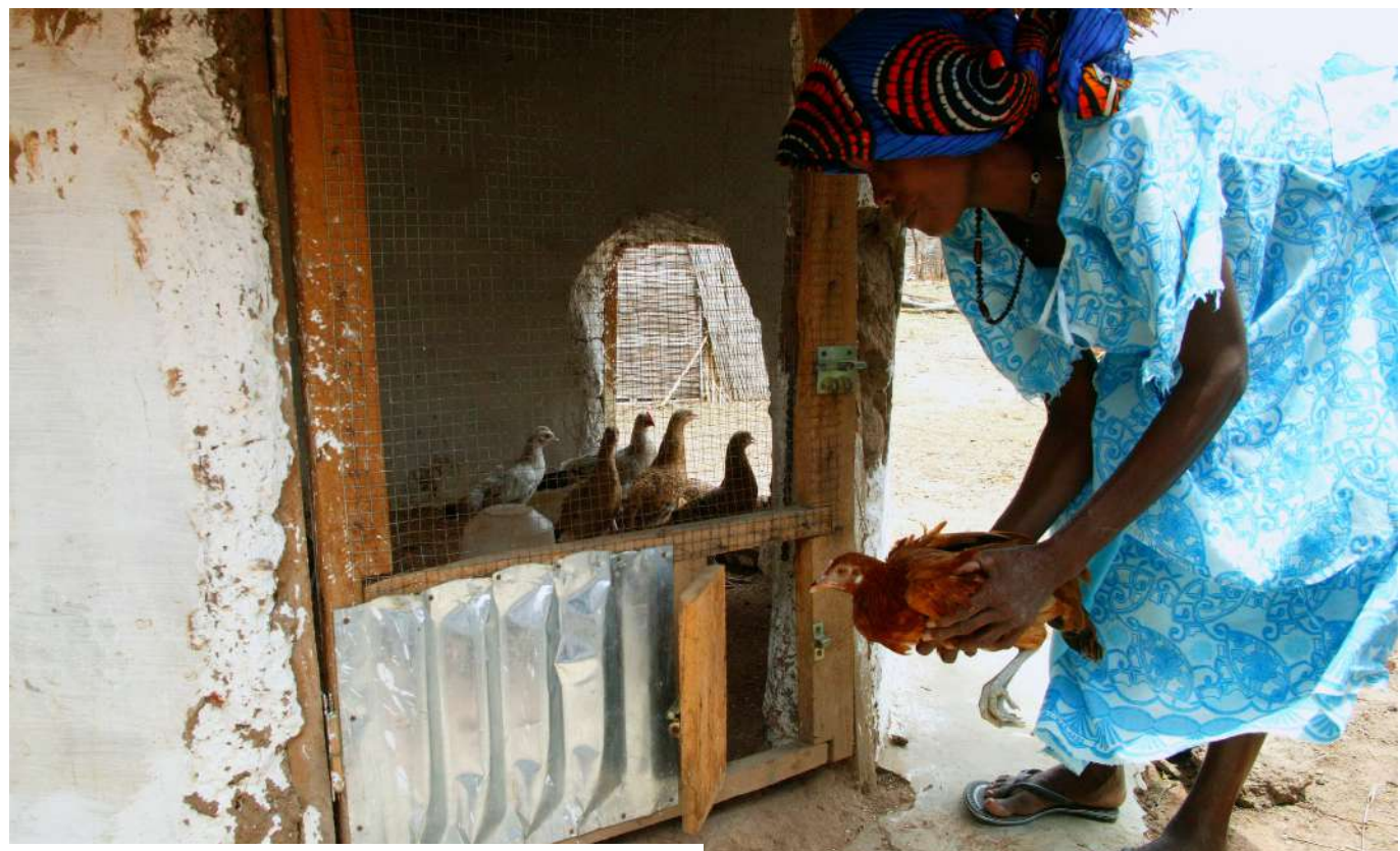
Improved chicken coop as a preventive management measure for animal health