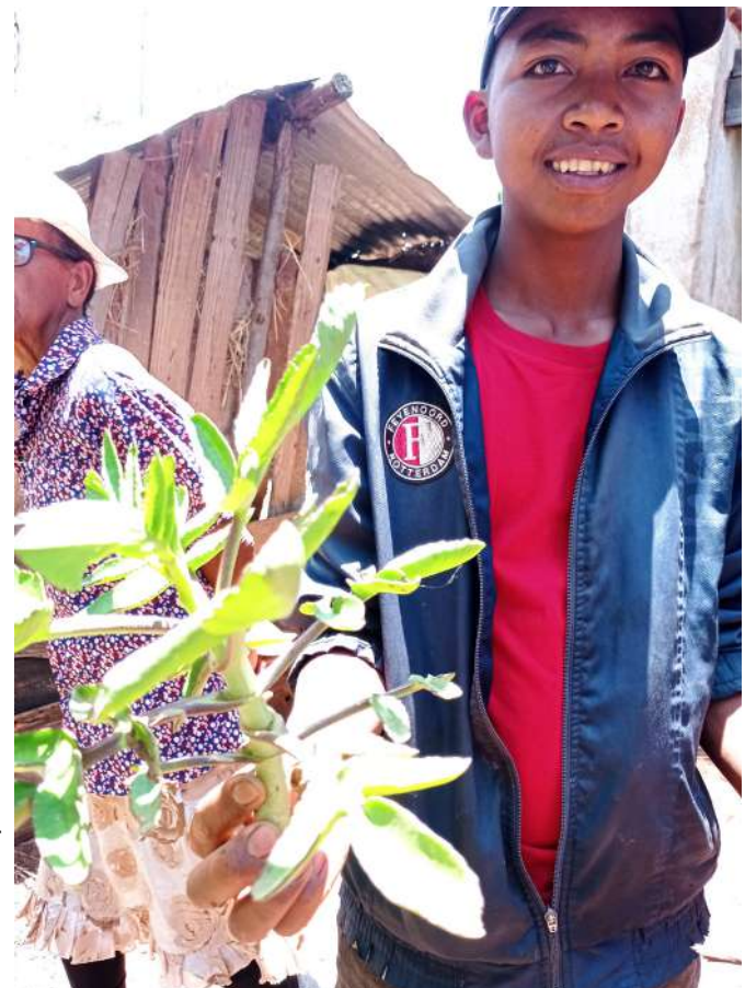
Plant used in livestock farming in the Vakinankaratra region in Madagascar